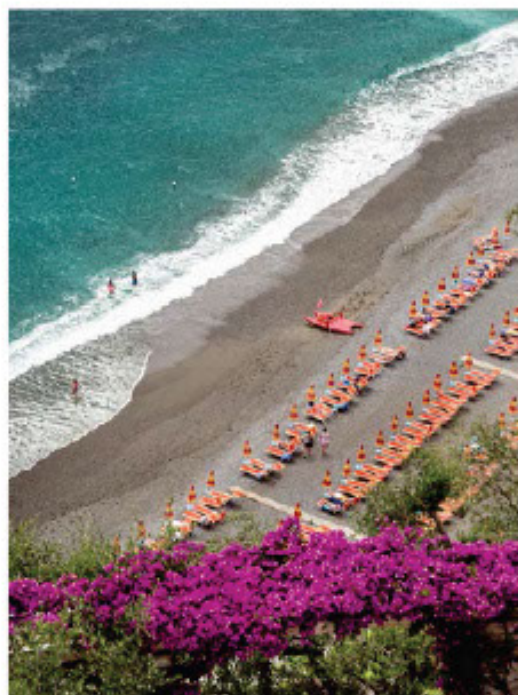
CLOCKWISE FROM TOP LEFT: PHOTOGRAPH COURTESY ALVARO GONZALEZ; JOSEPH HINEBOHELLS; CAROL BACHA; CAPPELLUCOURT BY HOTEL IL SAN PIETRO